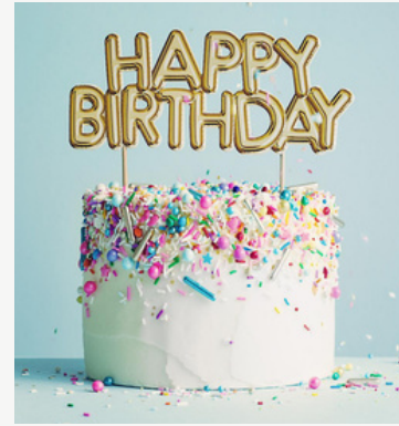
Matt McSherry (5/22)