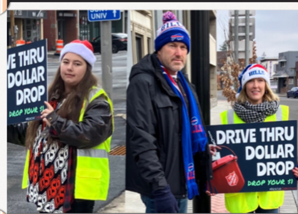
Salvation Army Dollar Drop