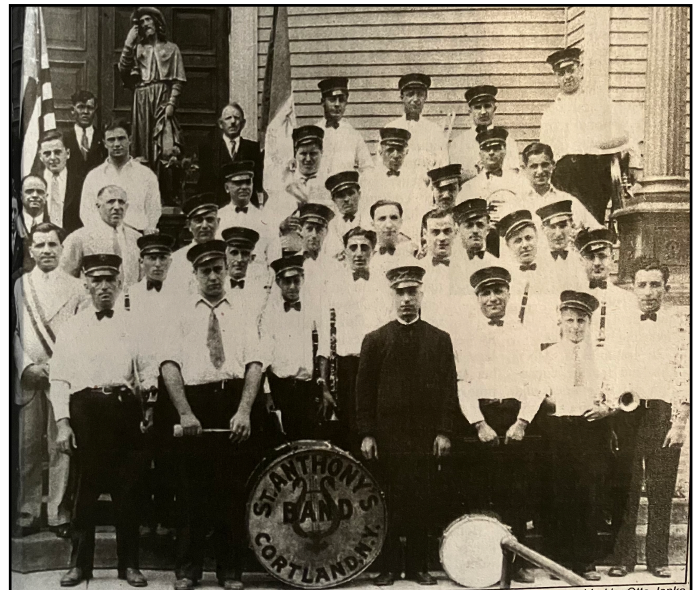
ST. ANTHONY'S BAND, 1929