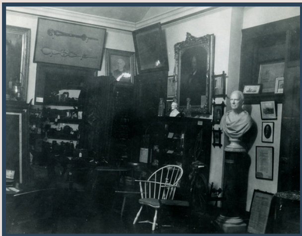
Cortland County Historical Society rooms at the County Courthouse.