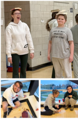
Compass program activities